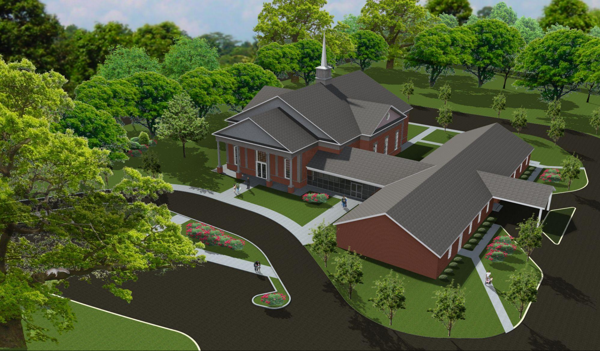
Overall View of campus.